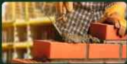
Ready to Build Homes