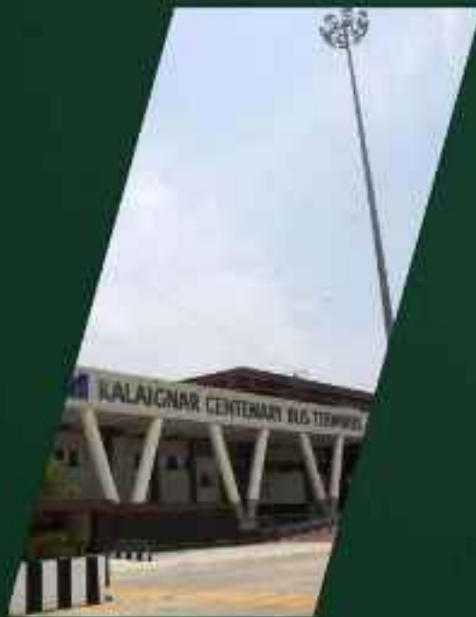
KILAMBAKKAM BUS TERMINUS

Golden Plots at SP Koil offer unparalleled location advantages, situated in close proximity to key landmarks such as Mahindra World City, SP Koil Railway Station, the 400ft Road, and Kilambakkam Bus Terminus. Residents enjoy seamless connectivity with enhanced transportation facilities, while also benefiting from easy access to SRM Hospital for medical needs. With strategic positioning amidst these vital hubs, investing in Golden Plots at SP Koil ensures a lifestyle of convenience and accessibility.