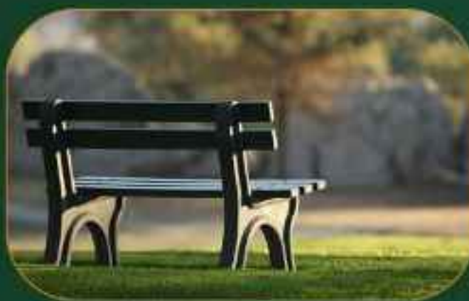
PARK WITH BENCH