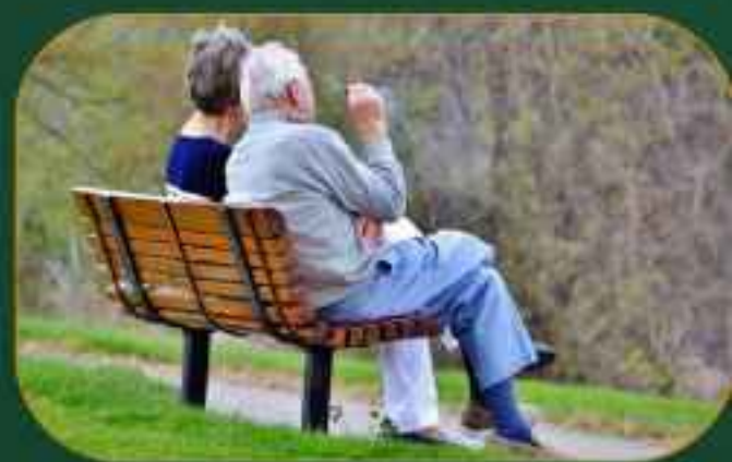
SENIOR CITIZEN PARK