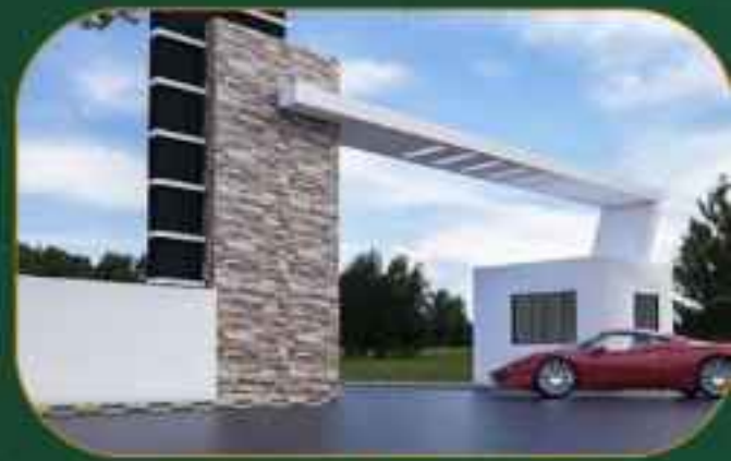
ENTRANCE ARCH & GATE