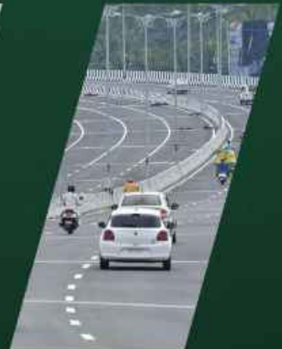
400 FT ROAD