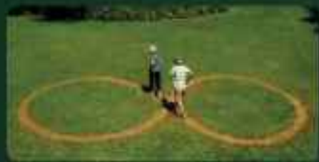
8 Walk track