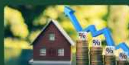
Fast Appreciation Location