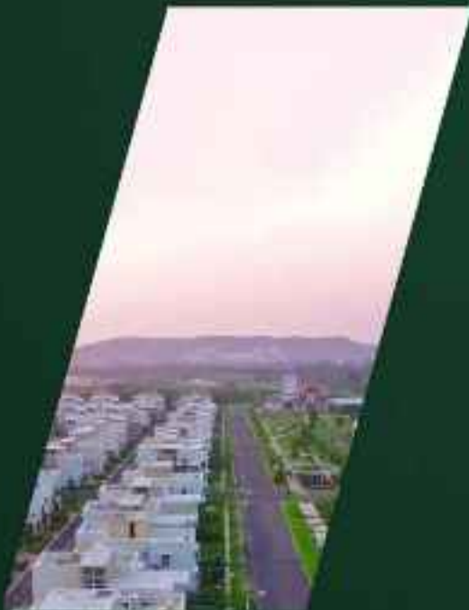
MAHINDRA WORLD CITY

Investors are keenly aware of the impact of location on property value. Areas experiencing robust economic growth, infrastructure development, and urban revitalization projects present attractive investment opportunities. Additionally, safety and security are paramount considerations when selecting a location. Opting for a neighborhood with low crime rates, reliable emergency services, and well-maintained infrastructure ensures peace of mind for residents and fosters a secure living environment conducive to family life and community engagement.