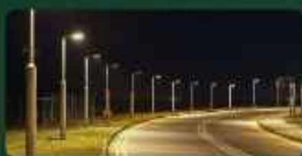
Street Lights Solar