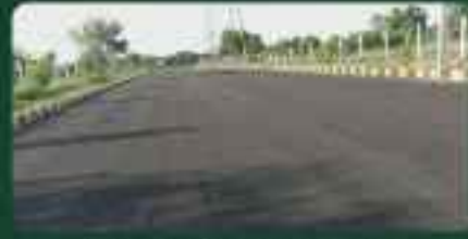
Black Top Roads