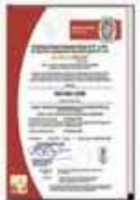
An ISO 9001:2015 Certified Company